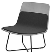
20 or 50