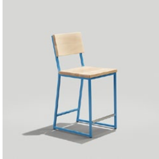
BRADY COUNTER STOOL Model: 250CH