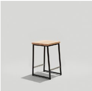
BRADY BACKLESS COUNTER STOOL — Model: 6250CH