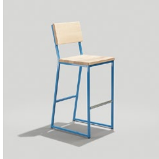
BRADY BARSTOOL Model: 250BS