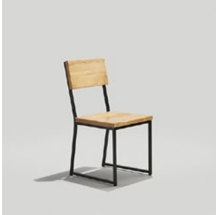
BRADY CHAIR Model: 250

Dimensions listed are for the base model of the product. For additional information on product dimensions, pricing and upholstery options, please visit the Price List .