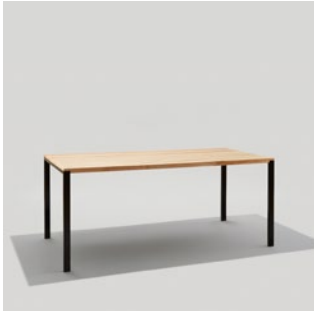
BRADY PEDESTAL TABLE 30" Dining Height OW: 24" OL: 24"