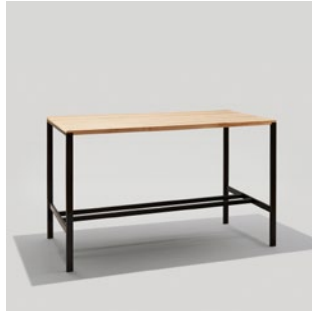
BRADY PEDESTAL TABLE 42" Bar Height OW: 24" OL: 24"