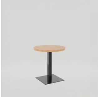
BRADY ROUND TABLE Available in 30, 36, and 42" heights OW: 30" OL: 30"

Dimensions listed are for the base model of the product. For additional information on product dimensions, pricing and upholstery options, please visit the Price List .