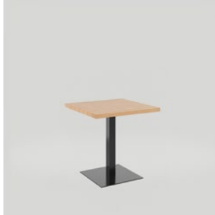
BRADY SQUARE TABLE Available in 30, 36, and 42" heights OW: 24" OL: 24"