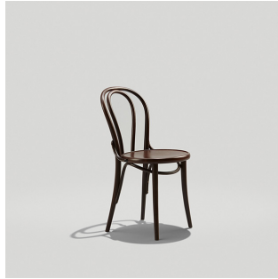
BENTWOOD NO. 18 CHAIR

OD: 20.25" SH: 18.25" OW: 16" OH: 33.25"