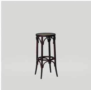
BENTWOOD NO. 73 BARSTOOL