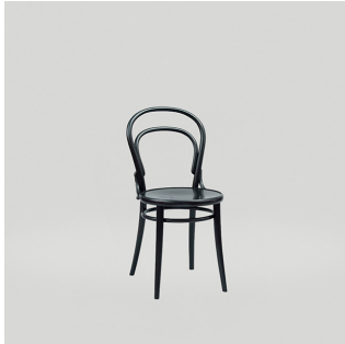
BENTWOOD NO. 14 CHAIR

Dimensions listed are for the base model of the product. For additional information on product dimensions, pricing and upholstery options, please visit the Price List.