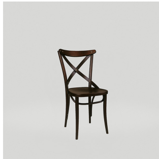
BENTWOOD NO. 150 CHAIR