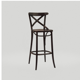
BENTWOOD NO. 150 BARSTOOL

OD: 15.94" SH: 18.25" OW: 17.75" OH: 34.25"