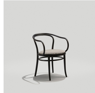
BENTWOOD NO. 30 ARMCHAIR