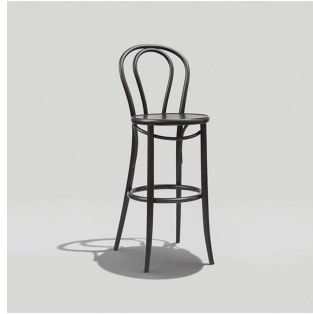
BENTWOOD NO. 18 BARSTOOL

OD: 20.25" SH: 18.25" OW: 16" OH: 33.25"