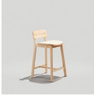
BROOKE COUNTER STOOL