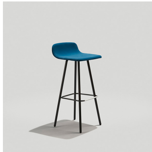
HARPER 4-LEG BARSTOOL

OD: 17.27" SH: 26.12" OW: 16.2" OH: 33.45"