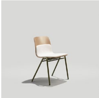
HARPER A-FRAME CHAIR

Dimensions listed are for the base model of the product. For additional information on product dimensions, pricing and upholstery options, please visit the Price List .