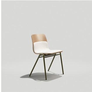
HARPER A-FRAME CHAIR

Dimensions listed are for the base model of the product. For additional information on product dimensions, pricing and upholstery options, please visit the Price List.