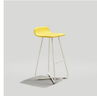
HARPER X-BASE BARSTOOL

OD: 17.88" SH: 25.98" OW: 16.07" OH: 33.21"