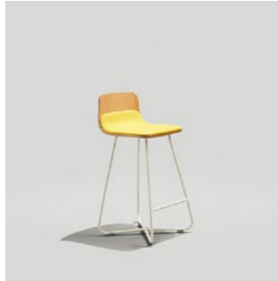
HARPER X-BASE COUNTER STOOL

OD: 20.38" SH: 18.8" OW: 17.33" OH: 31.52"