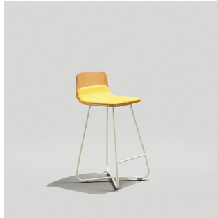
HARPER X-BASE COUNTER STOOL

OD: 20.38" SH: 18.8" OW: 17.33" OH: 31.52"