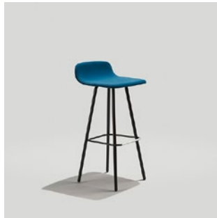
HARPER 4-LEG BARSTOOL

OD: 17.27" SH: 26.12" OW: 16.2" OH: 33.45"