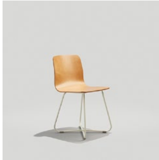
HARPER X-BASE CHAIR

OD: 20.36" SH: 18.84" OW: 22.38" OH: 31.69"