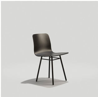
HARPER 4-LEG CHAIR

OD: 16.8" SH: 30.2" OW: 16.02" OH: 34.9"