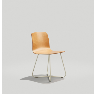
HARPER X-BASE CHAIR

OD: 20.36" SH: 18.84" OW: 22.38" OH: 31.69"