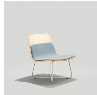
HARPER LOUNGE CHAIR

OD: 16.24" SH: 30.63" OW: 16.52" OH: 34.12"