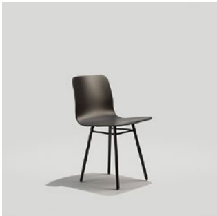
HARPER 4-LEG CHAIR

OD: 16.8" SH: 30.2" OW: 16.02" OH: 34.9"