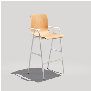
FULL HURDLE BARSTOOL Model: 332BS