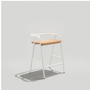
HALF HURDLE COUNTER STOOL Model: 331CH