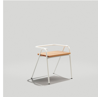
HALF HURDLE CHAIR Model: 331