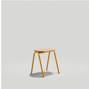
HURDLE STOOL Model: 330

Dimensions listed are for the base model of the product. For additional information on product dimensions, pricing and upholstery options, please visit the Price List.