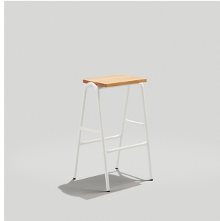
HURDLE BARSTOOL Model: 330BS