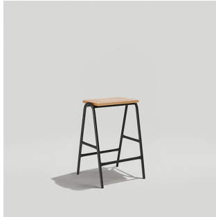
HURDLE COUNTER STOOL Model: 330CH