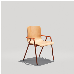
FULL HURDLE CHAIR Model: 332