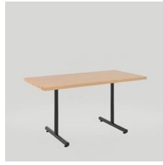
JEROME RECTANGULAR TABLE Available in 30, 36, and 42" heights OW: 24" OL: 42"