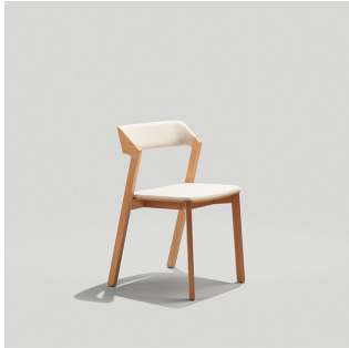
MERANO CHAIR Model: W400SC

Dimensions listed are for the base model of the product. For additional information on product dimensions, pricing and upholstery options, please visit the Price List.