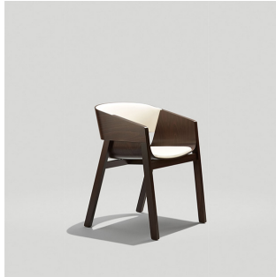
MERANO ARMCHAIR Model: W400AC