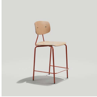
REECE COUNTER STOOL

OD: 18.21" SH: 17.6" OW: 18.75" OH: 31.7"