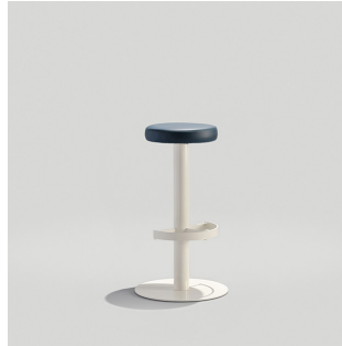
SALLY BARSTOOL Model: 227BS