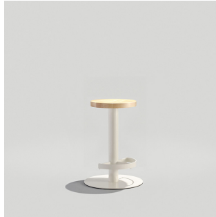
SALLY COUNTER STOOL Model: 227CH