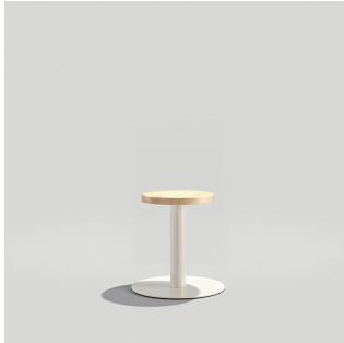
SALLY STOOL Model: 227

Dimensions listed are for the base model of the product. For additional information on product dimensions, pricing and upholstery options, please visit the Price List.