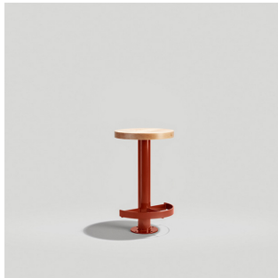
SALLY BOLT-DOWN / CORE-DRILLED COUNTER — Model: 226CH / 225CH