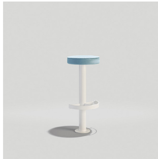
SALLY BOLT-DOWN / CORE-DRILLED BAR — Model: 226BS / 225BS