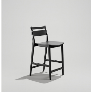
SIGSBEE COUNTER STOOL