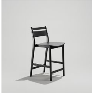
SIGSBEE COUNTER STOOL