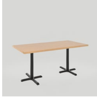
RAMBO RECTANGULAR TABLE Available in 30, 36, and 42" heights OW: 24" OL: 30"