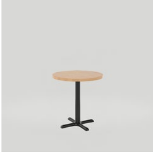
RAMBO ROUND TABLE Available in 30, 36, and 42" heights OW: 24" OL: 24"

Dimensions listed are for the base model of the product. For additional information on product dimensions, pricing and upholstery options, please visit the Price List .