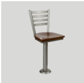
MELISSA 501 FIXED BARSTOOL Model: 501CS-3002, 4002