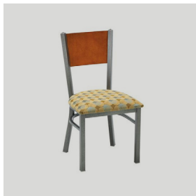
MELISSA 574 CHAIR Model: 574