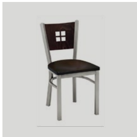
MELISSA 504 CHAIR Model: 504