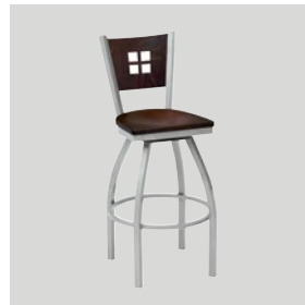
MELISSA 504 SWIVEL BARSTOOL Model: 6504BS