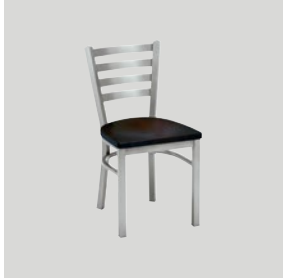
MELISSA 501 CHAIR Model: 501

Dimensions listed are for the base model of the product. For additional information on product dimensions, pricing and upholstery options, please visit the Price List .