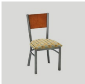
MELISSA 574 CHAIR Model: 574