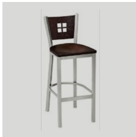
MELISSA 504 BARSTOOL Model: 504BS