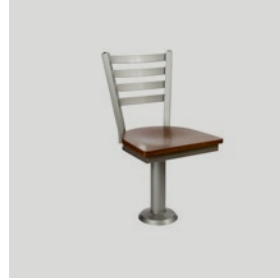
MELISSA 501 FIXED CHAIR Model: 501CS-3000, 4000