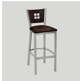
MELISSA 504 BARSTOOL Model: 504BS