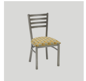
MELISSA 571 CHAIR Model: 571