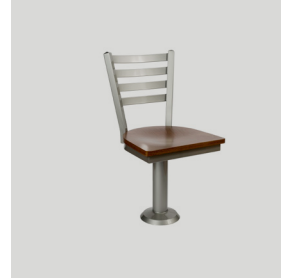
MELISSA 501 FIXED CHAIR Model: 501CS-3000, 4000