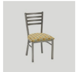
MELISSA 571 CHAIR Model: 571