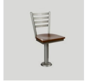
MELISSA 501 FIXED COUNTER STOOL Model: 501CS-3001, 4001