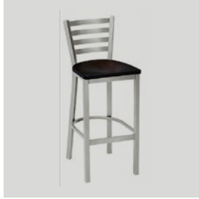
MELISSA 501 BARSTOOL Model: 501BS