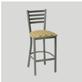
MELISSA 571 BARSTOOL Model: 571BS