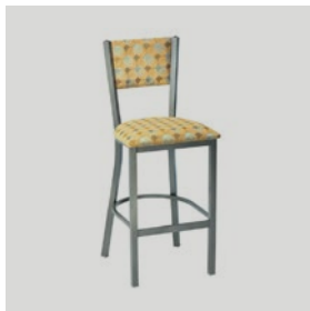
MELISSA 574 BARSTOOL Model: 574BS