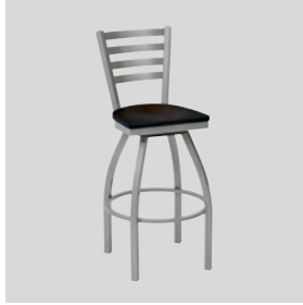
MELISSA 501 SWIVEL BARSTOOL Model: 6501BS