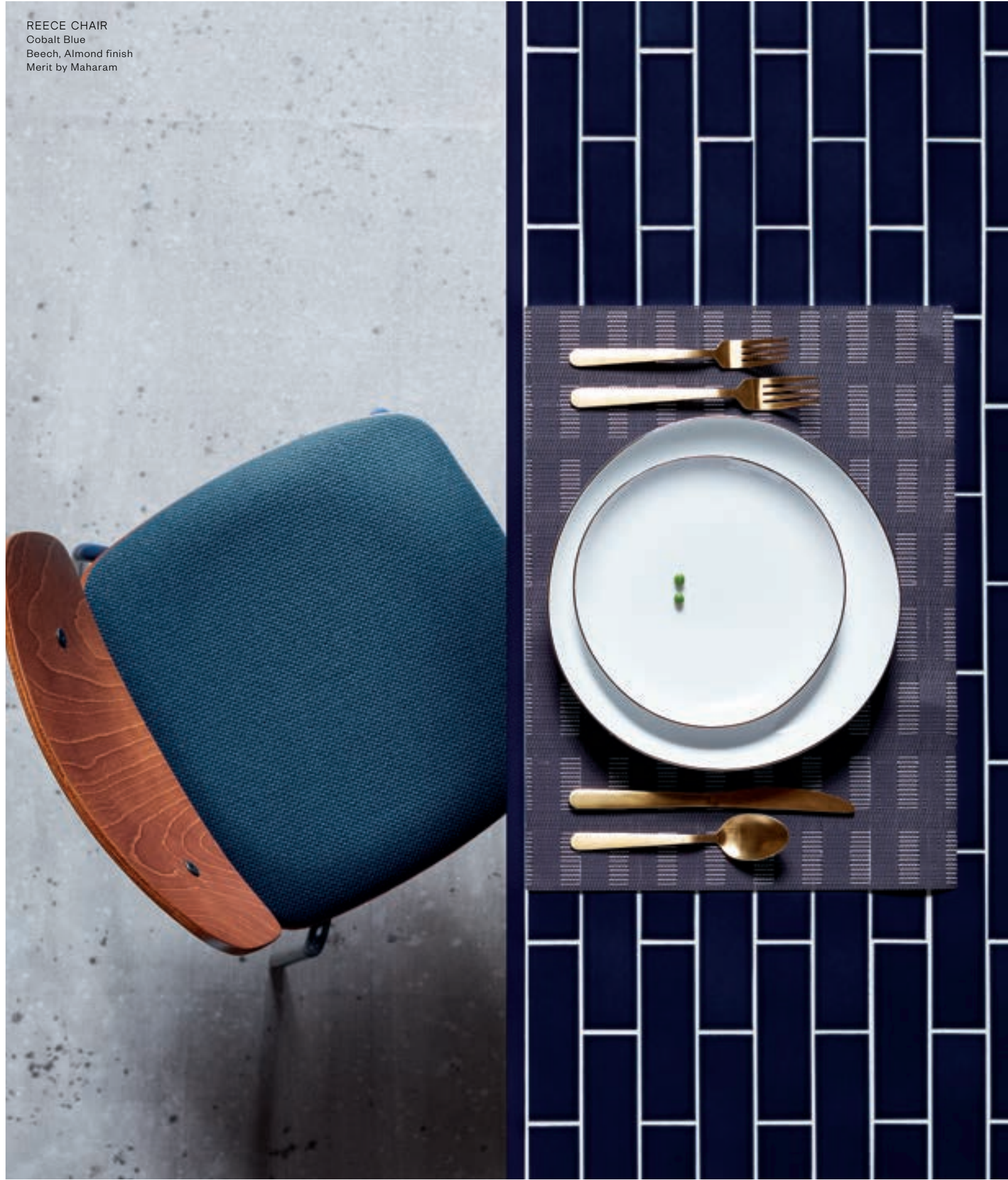
REECE CHAIR Cobalt Blue Beech, Almond finish Merit by Maharam