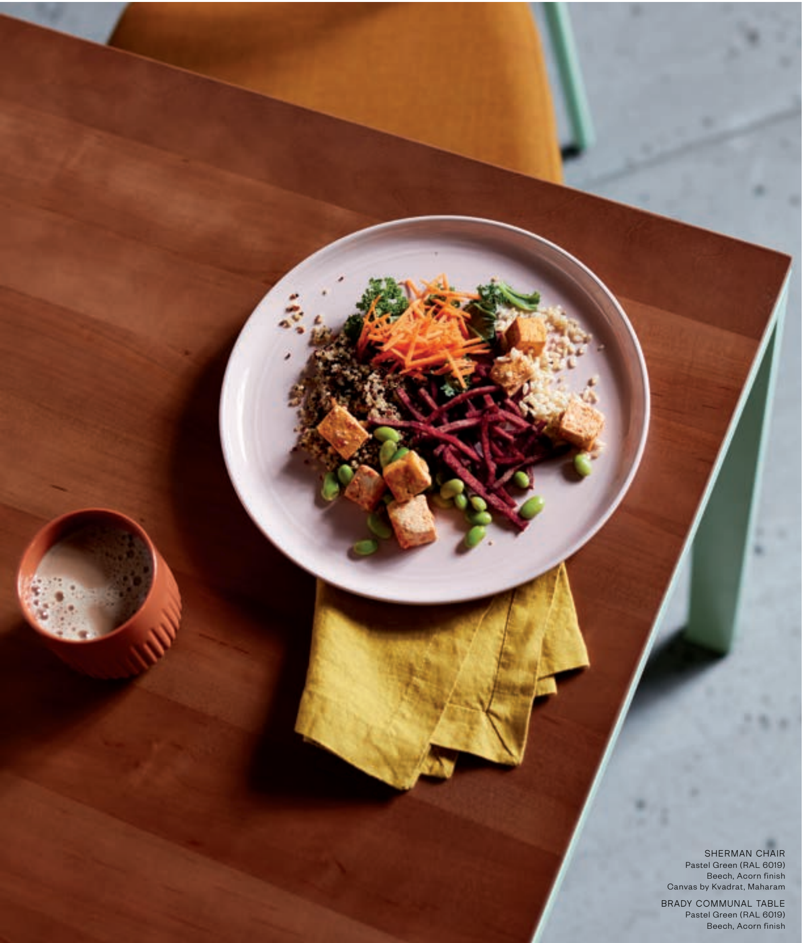
SHERMAN CHAIR Pastel Green (RAL 6019) Beech, Acorn finish Canvas by Kvadrat, Maharam BRADY COMMUNAL TABLE Pastel Green (RAL 6019) Beech, Acorn finish