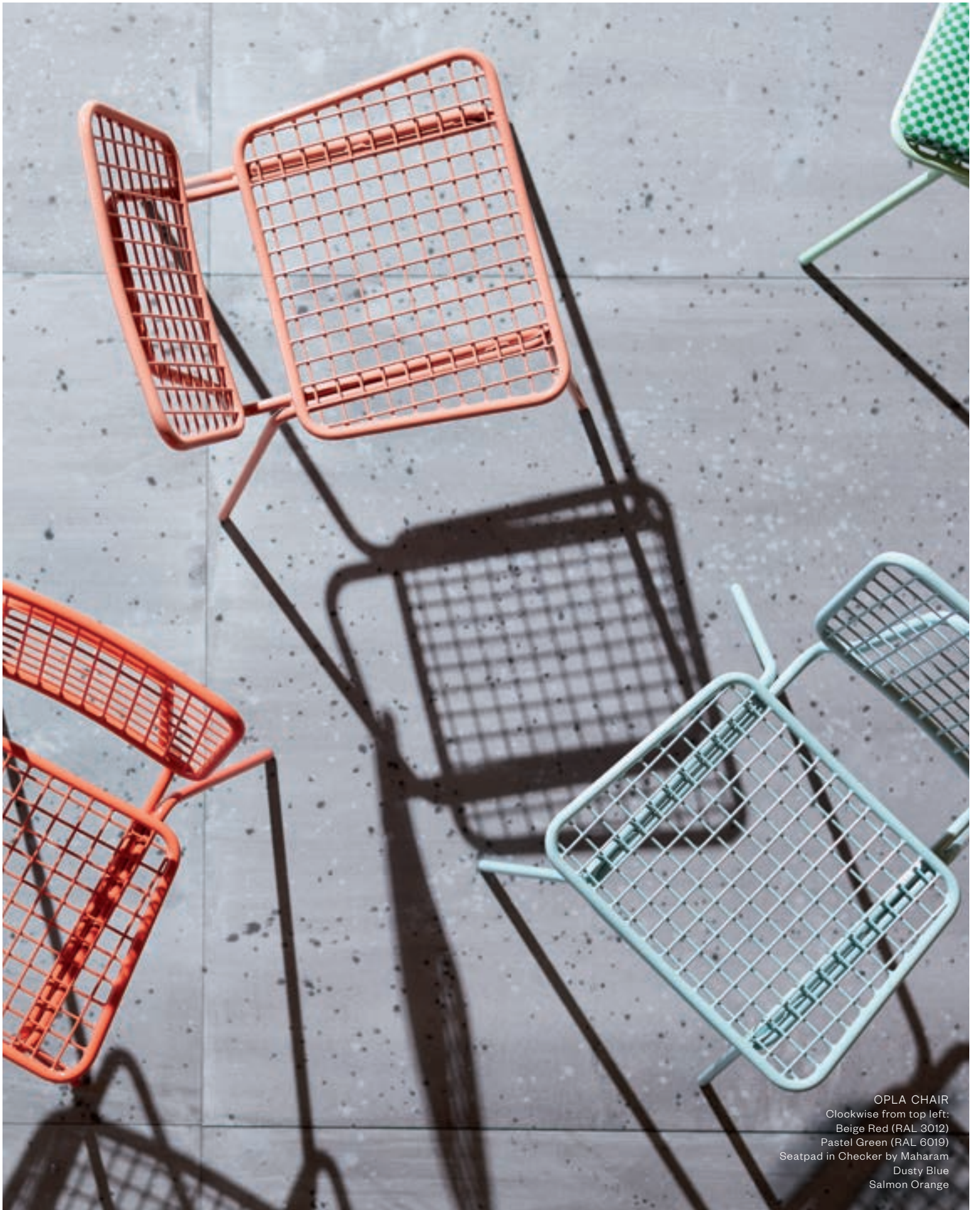
OPLA CHAIR Clockwise from top left: Beige Red (RAL 3012) Pastel Green (RAL 6019) Seatpad in Checker by Maharam Dusty Blue Salmon Orange