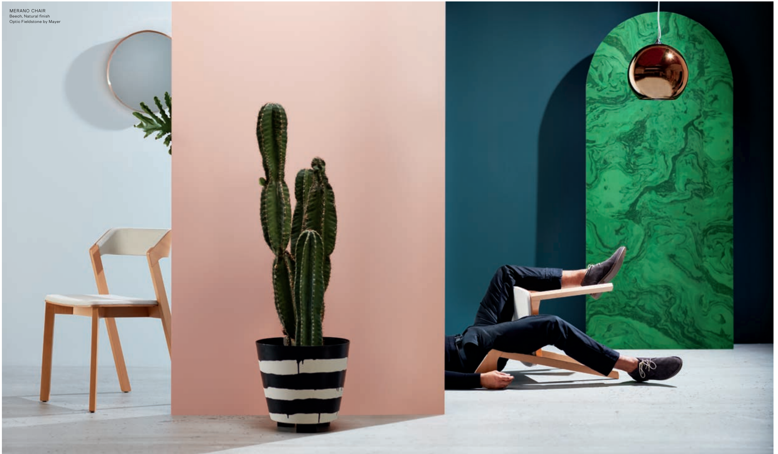
MERANO CHAIR Beech, Natural finish Optio Fieldstone by Mayer