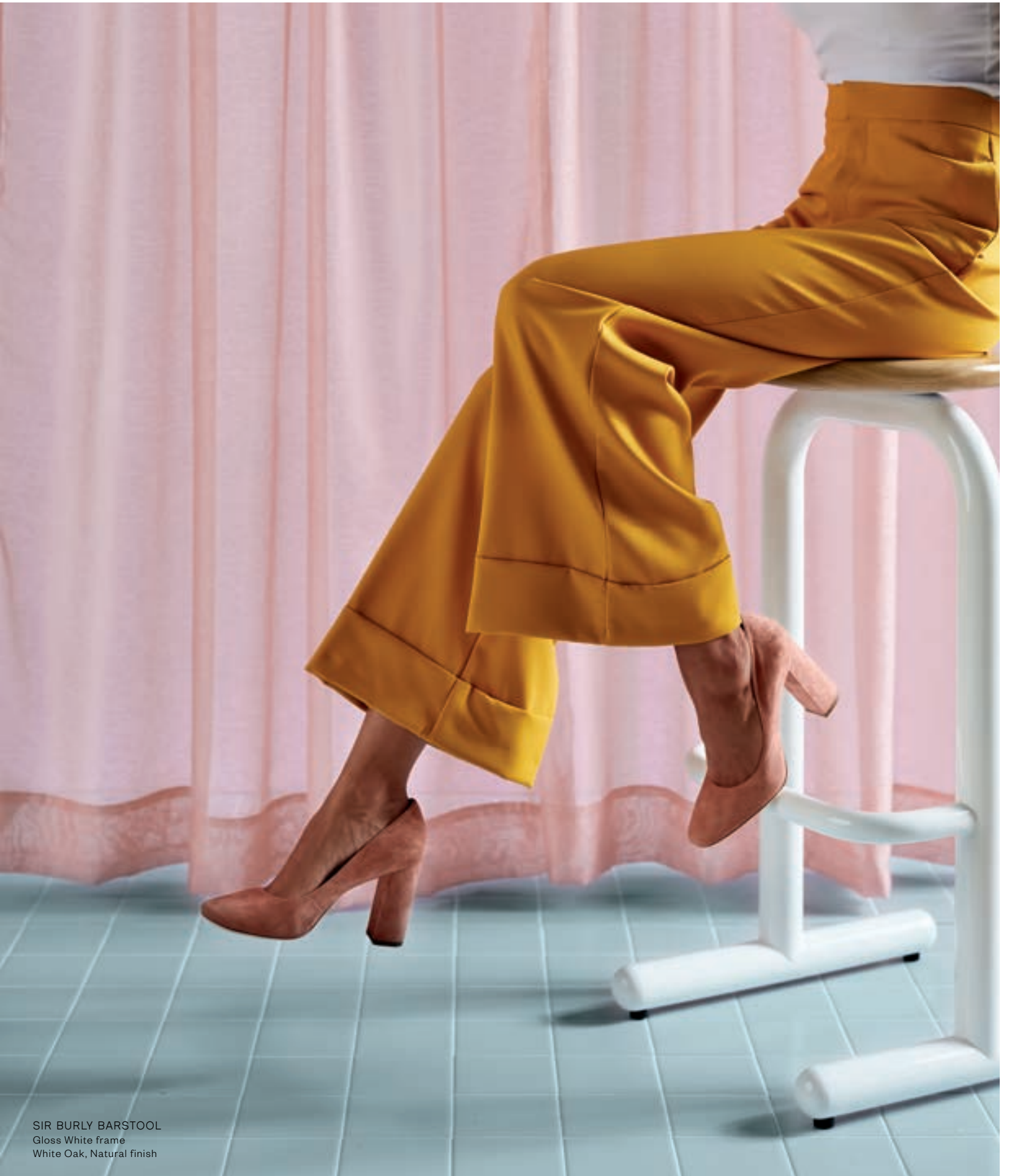
SIR BURLY BARSTOOL Gloss White frame White Oak, Natural finish