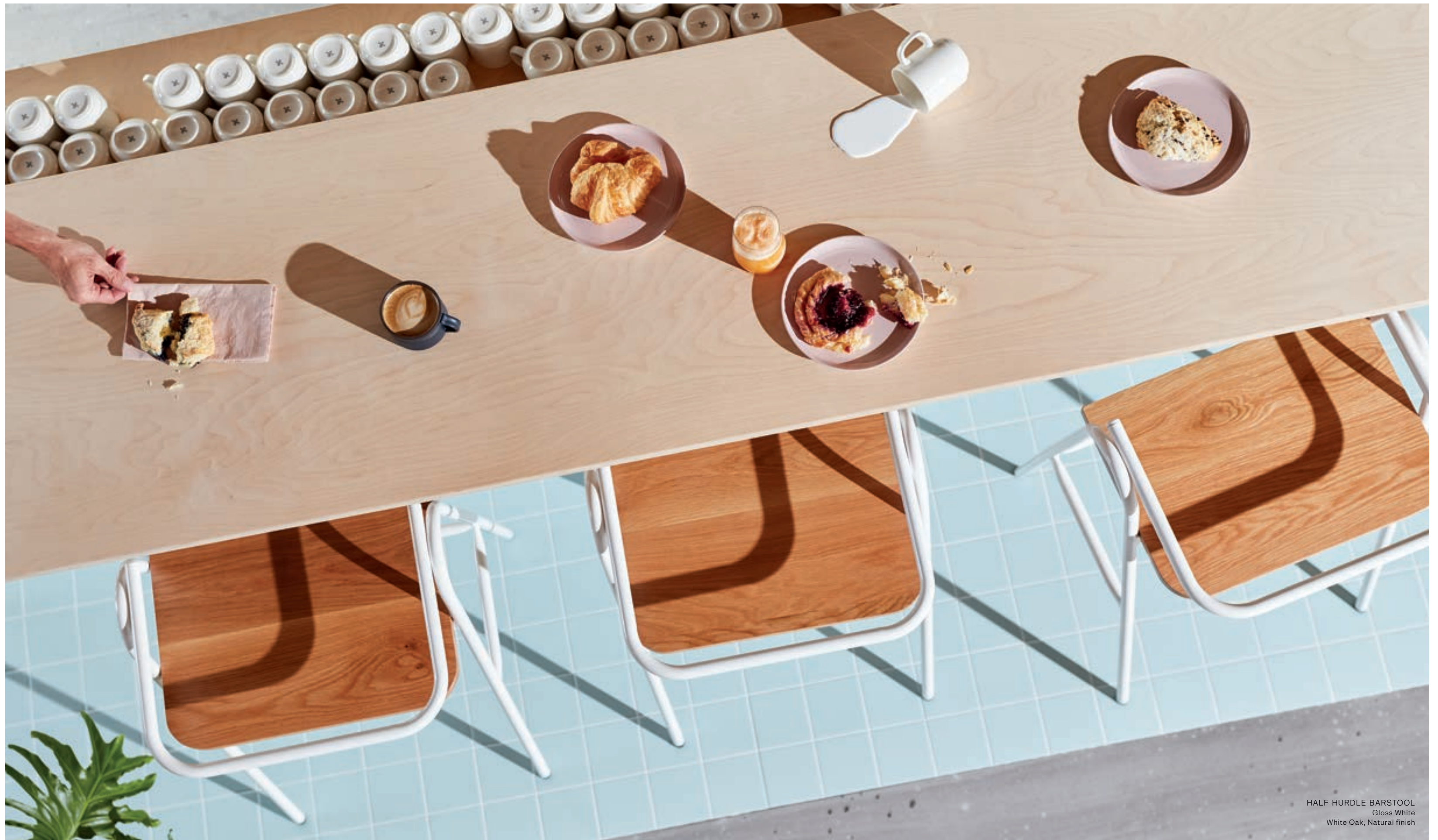
HALF HURDLE BARSTOOL Gloss White White Oak, Natural finish