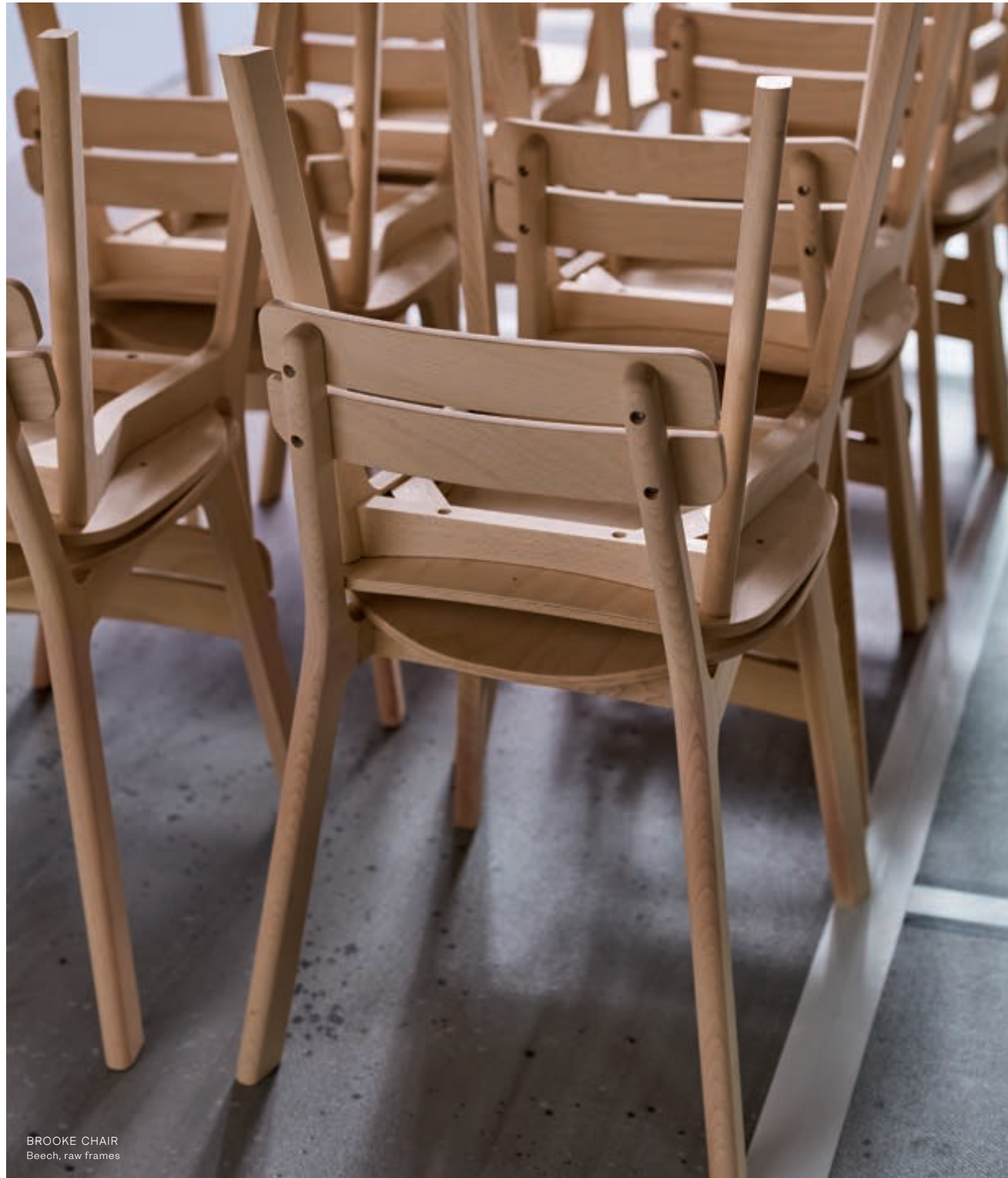
BROOKE CHAIR Beech, raw frames