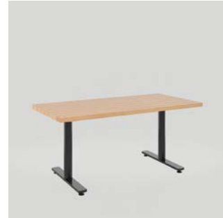
CASSANDRA RECTANGULAR T-BASE TABLE

24"W x 30, 36, 42, 48"L x 30, 36, 42"H 36"W x 42"L x 30, 36, 42"H 36"W x 48"L x 30" 42"W x 48"L x 30" H