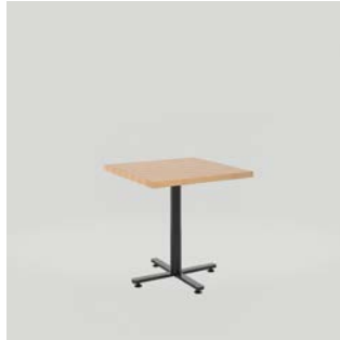
CASSANDRA SQUARE TABLE

24, 30, 36, 42" dia x 30, 36, 42"H 48, 54, 60, 72" dia x 30"H