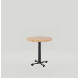
CASSANDRA ROUND TABLE

For additional information on product dimensions, pricing and upholstery options, please visit the Price List .